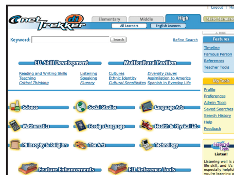
Find ELL materials and go to the Multicultural Pavilion.